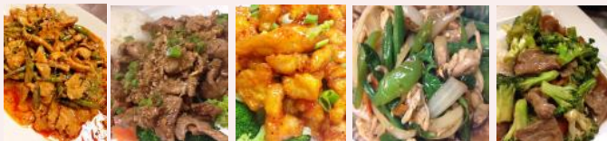
Panang Curry Pork Garlic ChickenVolcano Chicken Basil Beef Broccoli